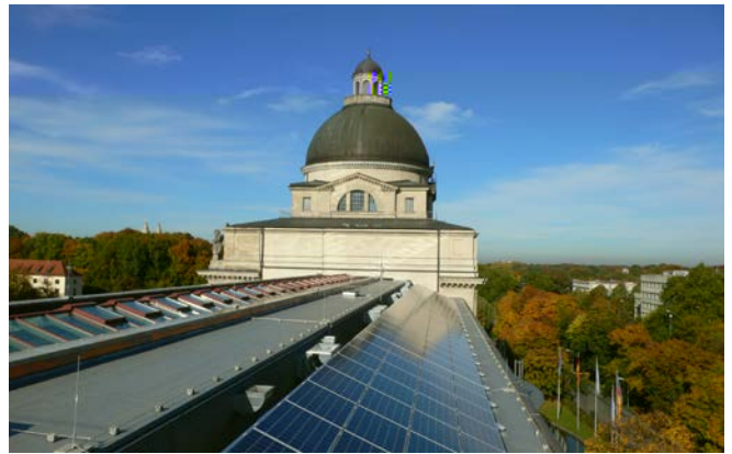
PC05 Trina Solar modules.

Tradition and modernity go hand in hand in Bavaria – and that also goes for the energy system and supply in this economically-strong Southeastern German state. The Bavarian State Chancellery, official residence of Horst Seehofer, Prime Minister of the State of Bavaria, is supplied with solar energy from a PV array. Covering a roof area of 800 square metres, the array generates 70 MWh of solar electricity, which is used by the State Chancellery directly. OneSolar International, a project developer for PV systems and wholesaler for solar products, installed the PV system on the heritage-protected building, using, 296 TSM-